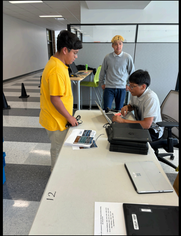
Student IT Support Team members make sure all students have an updated laptop.